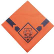
Rank Appropriate Neckerchief