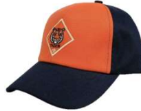
Rank Appropriate Hat