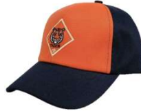
Rank Appropriate Hat