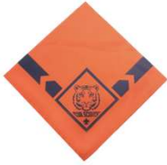
Rank Appropriate Neckerchief