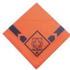
Rank Appropriate Neckerchief