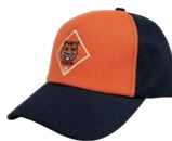
Rank Appropriate Hat